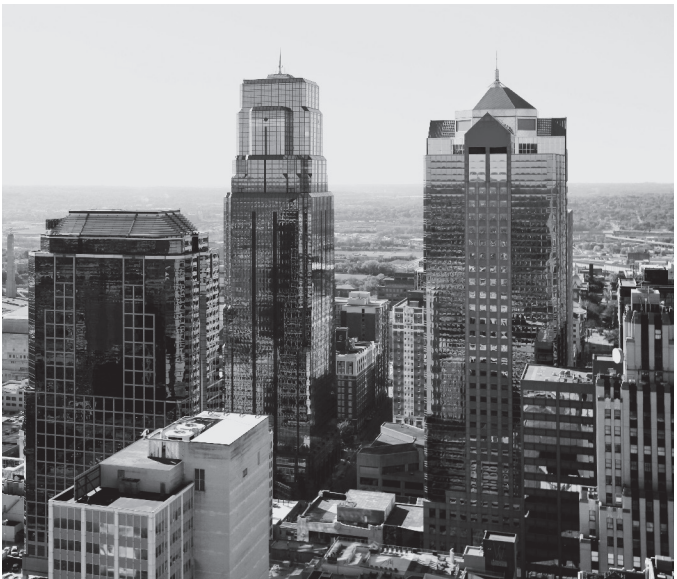
Photo: Kansas City Skyline

For safety and security purposes, official convention name badges will be required for all convention events.