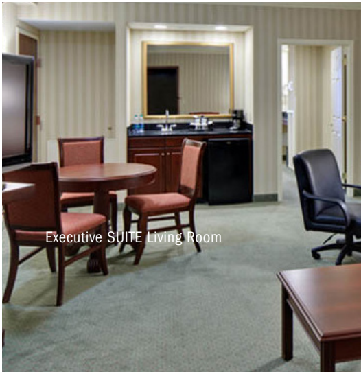
Executive SUITE Living Room